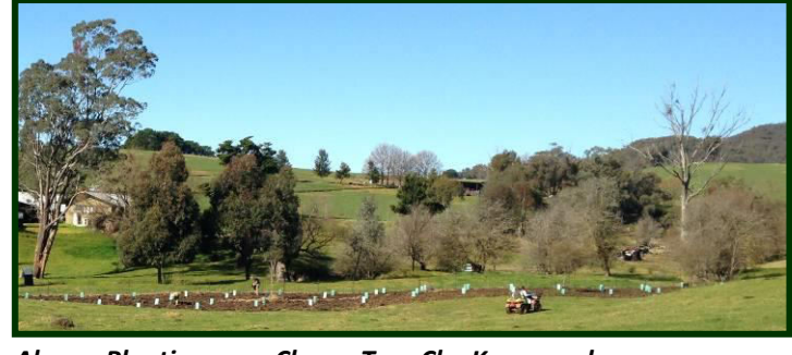
Above: Planting near Cherry Tree Ck - Kergunyah