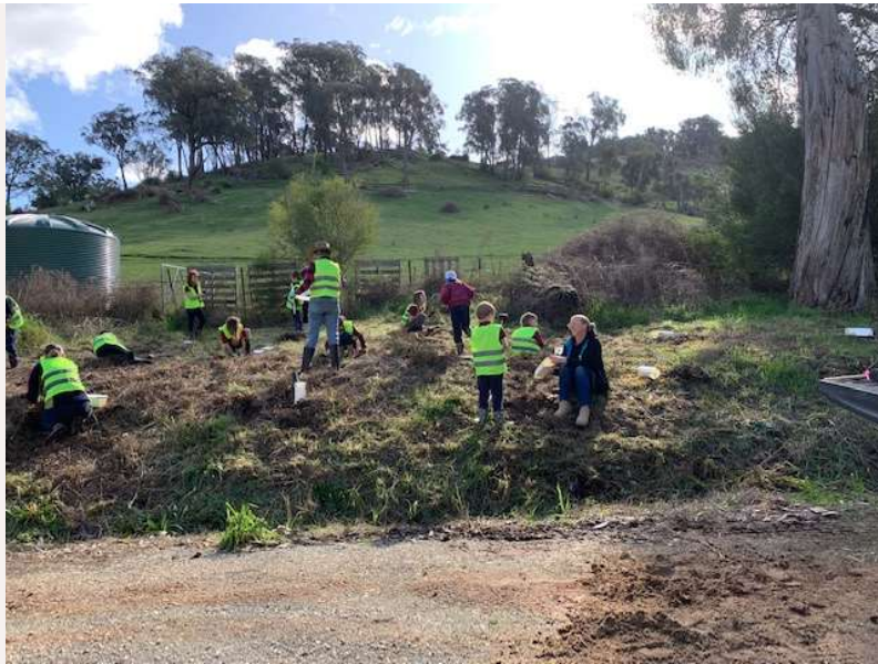
Students from Dederang Primary school planting at Dederang Gap reserve