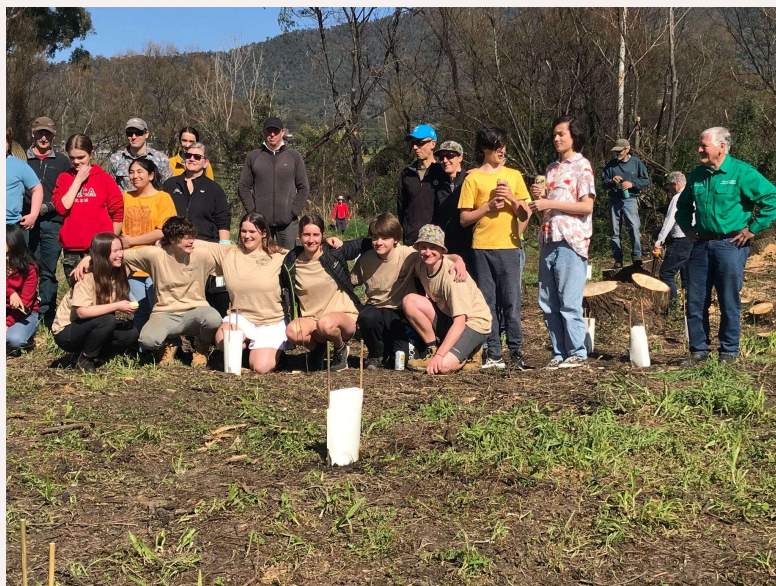
Students and community members at the planting day on the 3rd September.

Upper Kiewa Landcare would like to thank Alpine Shire, 15-trees and GJ Gardiner Homes (for the supply of the trees) and Mount Beauty Secondary College for making this possible.