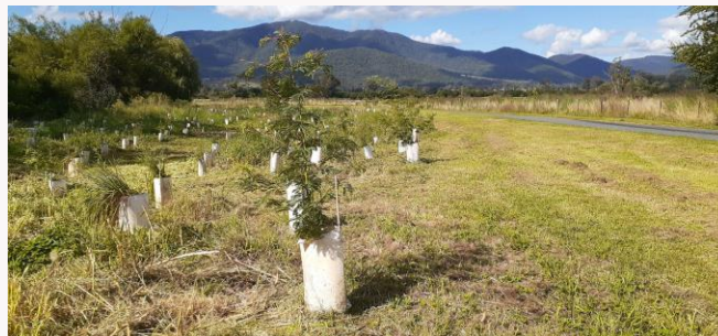
Photo showing the cleared trees on the Kiewa River walking trail

Working bees on the Kiewa Walking Trail (Pebble Beach) were undertaken to control weeds and remove a large area of dead willows. The group had to work hard to find the plants amongst the weeds but to their great pleasure there has been about a 90% success rate with some plants reaching almost 2m high. Not bad in 9 months!