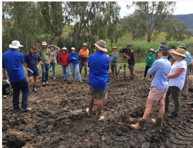
Participants learning about the benefits of composting