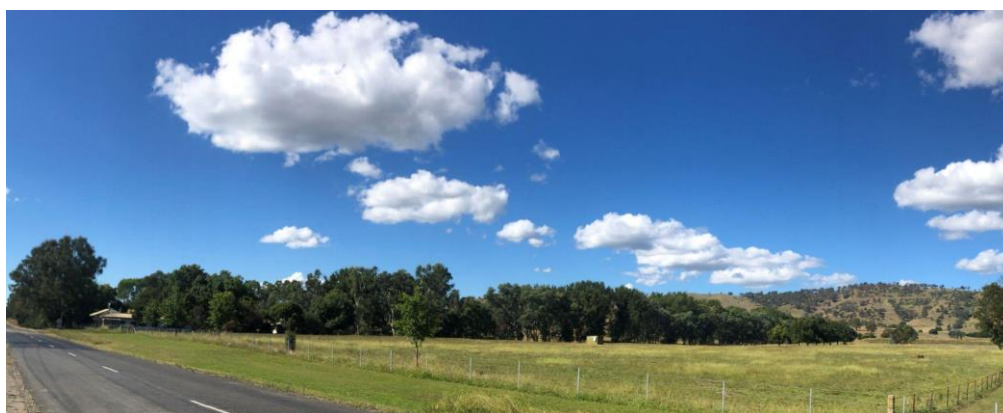
View of the gully planting from the east side of Gundowring Road