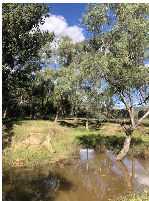
Close up photo of the first gully planting undertaken by the Kiewa Valley Farm Trees and Land Protection Group