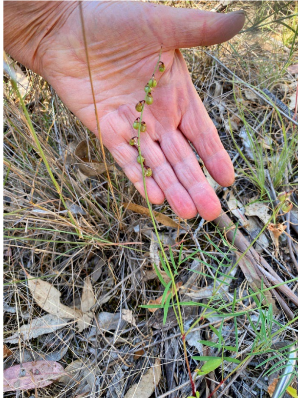
Mountain Swainson-pea ( Swainsona recta ) plant with seed setting.

To our surprise, at least four healthy plants were found and that two of these plants had seed pods.