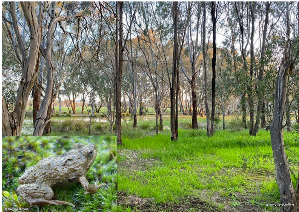
Sloane's Froglet ( Crinia sloanei) and Chiltern Valley No 1 Dam.