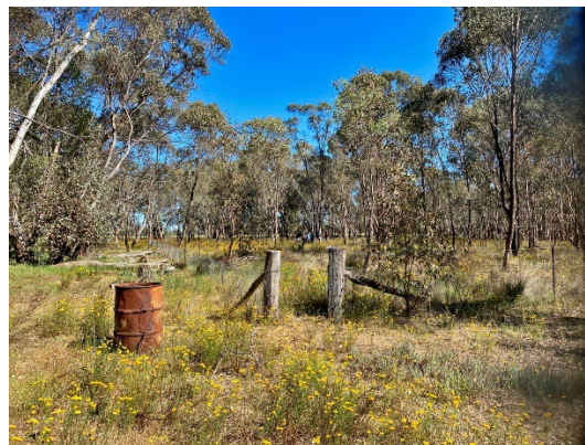
Exclusion area.

The reserve includes an exclusion area that is very effective at reducing the grazing pressure from the many local kangaroos.