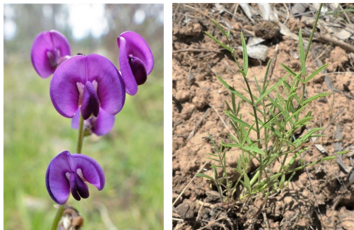
Mountain Swainson-pea ( Swainsona recta ).

We have known for some time that there were two Mountain Swainson pea ( Swainsona recta ) plants in this exclusion area since several seedlings had been re-planted at the site in recent years.